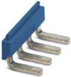
Insertion bridge, pitch: 6.15 mm, number of positions: 4, color: blue

Please be informed that the data shown in this PDF Document is generated from our Online Catalog. Please find the complete data in the user's documentation. Our General Terms of Use for Downloads are valid ( http://phoenixcontact.com/download )