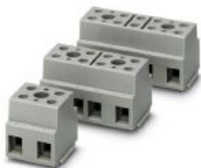
Device terminal block, for direct mounting, 3-pos.

Please be informed that the data shown in this PDF Document is generated from our Online Catalog. Please find the complete data in the user's documentation. Our General Terms of Use for Downloads are valid ( http://phoenixcontact.com/download )