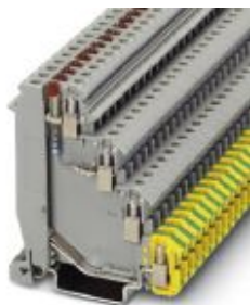
Sensor/actuator terminal block, connection method: Screw connection, cross section: 0.2 mm 2 - 4 mm 2 , AWG: 24 - 12, width: 6.2 mm, color: gray, mounting type: NS 35/7,5, NS 35/15

Please be informed that the data shown in this PDF Document is generated from our Online Catalog. Please find the complete data in the user's documentation. Our General Terms of Use for Downloads are valid ( http://phoenixcontact.com/download )