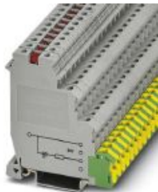
Sensor/actuator terminal block, connection method: Screw connection, cross section: 0.2 mm 2 - 4 mm 2 , AWG: 24 - 12, width: 6.2 mm, color: gray, mounting type: NS 35/7,5, NS 35/15

Please be informed that the data shown in this PDF Document is generated from our Online Catalog. Please find the complete data in the user's documentation. Our General Terms of Use for Downloads are valid ( http://phoenixcontact.com/download )