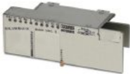
The figure shows version IBS RL 24 BK RB-LK-LK

Bus coupler with remote bus branch for INTERBUS; twisted pair with 500 kbaud, rugged metal housing with IP67 protection, tool-free mounting on a separate mounting plate, can be used directly on welding robots