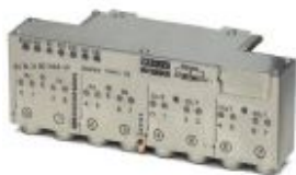
The figure shows version IBS RL 24 DIO 8/8/8-LK

Digital I/O device for INTERBUS; fiber optic technology with 2 Mbaud, eight inputs (24 V DC), eight outputs (24 V DC, 0.5 A), sensor/actuator connection via 5-pos. M12 female connectors, rugged metal housing, IP67 protection