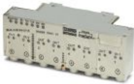
The figure shows version IBS RL 24 DO 8/8-2A-LK-2MBD

Digital output device for INTERBUS; fiber optic technology with 2 Mbaud, with 8 outputs (24 V DC, 2 A), actuator connection via 5-pos. M12 female connectors, rugged metal housing, IP67 protection