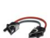
Assembled cable jumper as a short connection between two INTERBUS Rugged Line devices with fiber optic bus connectors and power supply, approximately 30 cm

Cable set - IBS RL CONNECTION-LK - 2733029