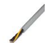
Power supply cable, gray, welding-splash-resistant in standard applications, 5 x 1.5 mm 2 , highly flexible, sold by the meter