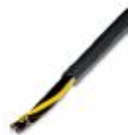
Power supply cable, gray, welding-splash-resistant in standard applications, 5 x 1.5 mm 2 , sold by the meter