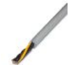
Power supply cable, gray, welding-splash-resistant in standard applications, 5 x 1.5 mm 2 , highly flexible, sold by the meter