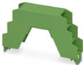
DIN rail housing, Upper housing part for connectors with header, width: 22.6 mm, height: 102 mm, depth: 60.15 mm, color: green (6021)

Please be informed that the data shown in this PDF Document is generated from our Online Catalog. Please find the complete data in the user's documentation. Our General Terms of Use for Downloads are valid ( http://phoenixcontact.com/download )