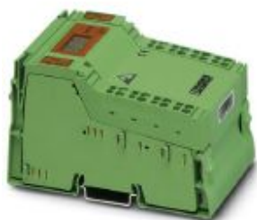
AS-i Gateway for Inline, IP20 protection, color: Green

Please be informed that the data shown in this PDF Document is generated from our Online Catalog. Please find the complete data in the user's documentation. Our General Terms of Use for Downloads are valid ( http://phoenixcontact.com/download )