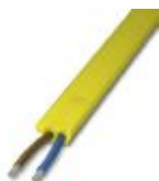
AS-Interface PVC flat conductor with UL in yellow, 2 x 1.5 mm 2 , 100 m ring

Flat-ribbon conductor - VS-ASI-FC-PVC-UL-YE 100M - 1404906