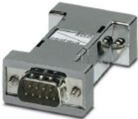
PROFIBUS ECO Link, RS-232 (V.24) PROFIBUS converter, incl. software for PC

Please be informed that the data shown in this PDF Document is generated from our Online Catalog. Please find the complete data in the user's documentation. Our General Terms of Use for Downloads are valid ( http://phoenixcontact.com/download )