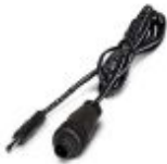
Cinch connecting cable, for addressing FLX ASI M12 devices

Cable for programming - ASI CC ADR CAB CINCH - 2741341