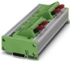
Coupling module (Gateway) degree of protection IP20, with fiber optic remote bus connection

Please be informed that the data shown in this PDF Document is generated from our Online Catalog. Please find the complete data in the user's documentation. Our General Terms of Use for Downloads are valid ( http://phoenixcontact.com/download )