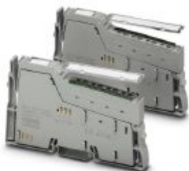
Connector set for distance terminal

Please be informed that the data shown in this PDF Document is generated from our Online Catalog. Please find the complete data in the user's documentation. Our General Terms of Use for Downloads are valid ( http://phoenixcontact.com/download )