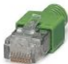
The figure shows the version FL PLUG RJ45 GN/2

RJ45 connector, shielded, with bend protection sleeve, 2 pieces, gray for straight cables, for assembly on site. For connections that are not crossed, it is recommended that you use the connector set with gray bend protection sleeve.