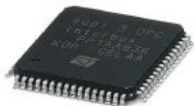
Slave protocol chip, for INTERBUS

Please be informed that the data shown in this PDF Document is generated from our Online Catalog. Please find the complete data in the user's documentation. Our General Terms of Use for Downloads are valid ( http://phoenixcontact.com/download )