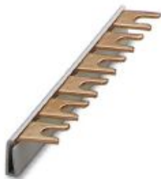
Wiring bridge for modules with connecting pitch 17.5 mm, 1-phase, 6-pos.

Please be informed that the data shown in this PDF Document is generated from our Online Catalog. Please find the complete data in the user's documentation. Our General Terms of Use for Downloads are valid ( http://phoenixcontact.com/download )