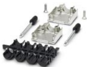
POWER-SUBCON cable housing, 3-pos.

Please be informed that the data shown in this PDF Document is generated from our Online Catalog. Please find the complete data in the user's documentation. Our General Terms of Use for Downloads are valid ( http://phoenixcontact.com/download )