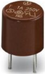
Replacement fuse, for INTERBUS-ST modules

Please be informed that the data shown in this PDF Document is generated from our Online Catalog. Please find the complete data in the user's documentation. Our General Terms of Use for Downloads are valid ( http://phoenixcontact.com/download )