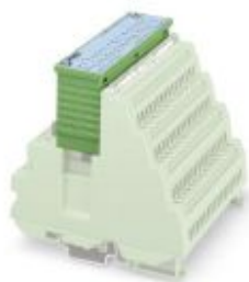
Replacement module electronics for IB ST (ZF) 24 BDO 32/2

Please be informed that the data shown in this PDF Document is generated from our Online Catalog. Please find the complete data in the user's documentation. Our General Terms of Use for Downloads are valid ( http://phoenixcontact.com/download )