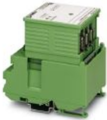
Replacement module electronics for IBS ST (ZF) 24 BK RB-T

Please be informed that the data shown in this PDF Document is generated from our Online Catalog. Please find the complete data in the user's documentation. Our General Terms of Use for Downloads are valid ( http://phoenixcontact.com/download )