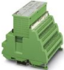
Replacement module electronics for IBS ST (ZF) 24 BK DIO 8/8/3-T

Please be informed that the data shown in this PDF Document is generated from our Online Catalog. Please find the complete data in the user's documentation. Our General Terms of Use for Downloads are valid ( http://phoenixcontact.com/download )