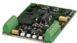
Universal I/O module in the form of a daughterboard

Please be informed that the data shown in this PDF Document is generated from our Online Catalog. Please find the complete data in the user's documentation. Our General Terms of Use for Downloads are valid ( http://phoenixcontact.com/download )