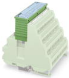
Replacement module electronics for IB ST (ZF) 24 AO 4/SF

Please be informed that the data shown in this PDF Document is generated from our Online Catalog. Please find the complete data in the user's documentation. Our General Terms of Use for Downloads are valid ( http://phoenixcontact.com/download )