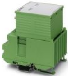
Replacement module electronics for IB ST (ZF) 24 BK-T

Please be informed that the data shown in this PDF Document is generated from our Online Catalog. Please find the complete data in the user's documentation. Our General Terms of Use for Downloads are valid ( http://phoenixcontact.com/download )