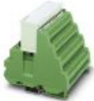
Replacement clamping part for IB ST 24 DI 32/2

Replacement clamping part - IB STTB 24 DI 32/2 - 2753012