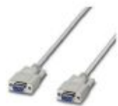
RS-232 cable, 9-pos. D-SUB socket on 9-pos. D-SUB socket, 9-wire, 1:1

Data cable - PSM-KA9SUB9/BB/2METER - 2799474