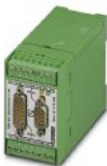
Interface converter, for converting RS-232 to RS-485 2-wire, with electrical isolation, DIN-rail mountable

Please be informed that the data shown in this PDF Document is generated from our Online Catalog. Please find the complete data in the user's documentation. Our General Terms of Use for Downloads are valid ( http://phoenixcontact.com/download )