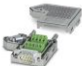
D-SUB connector, 9-pos., male connector, one cable entry < 35°, universal type for all systems, pin assignment: 1, 2, 3, 4, 5, 6, 7, 8, 9 to screw connection terminal block

D-SUB bus connector - SUBCON 9/M-SH - 2761509