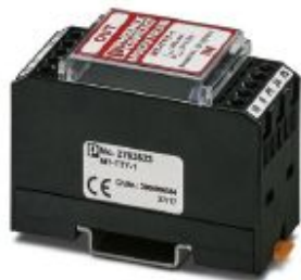
Rail-mountable module with surge protection for TTY interface, for mounting on NS 35/7.5, housing width: 30 mm

Please be informed that the data shown in this PDF Document is generated from our Online Catalog. Please find the complete data in the user's documentation. Our General Terms of Use for Downloads are valid ( http://phoenixcontact.com/download )