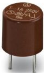
Replacement fuse, for INTERBUS-ST modules

Please be informed that the data shown in this PDF Document is generated from our Online Catalog. Please find the complete data in the user's documentation. Our General Terms of Use for Downloads are valid ( http://phoenixcontact.com/download )