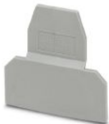
End cover, length: 56 mm, width: 2.5 mm, height: 52 mm, color: gray

Please be informed that the data shown in this PDF Document is generated from our Online Catalog. Please find the complete data in the user's documentation. Our General Terms of Use for Downloads are valid ( http://phoenixcontact.com/download )