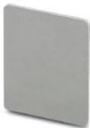
Separating plate, length: 14 mm, width: 0.5 mm, height: 16 mm, color: gray

Please be informed that the data shown in this PDF Document is generated from our Online Catalog. Please find the complete data in the user's documentation. Our General Terms of Use for Downloads are valid ( http://phoenixcontact.com/download )