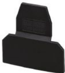
End cover, length: 56 mm, width: 2.5 mm, height: 66.5 mm, color: black

Please be informed that the data shown in this PDF Document is generated from our Online Catalog. Please find the complete data in the user's documentation. Our General Terms of Use for Downloads are valid ( http://phoenixcontact.com/download )