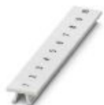
Zack marker strip, Strip, white, labeled, can be labeled with: CMS-P1-PLOTTER, printed horizontally: consecutive numbers 1 ... 10, 11 ... 20, etc. up to 491 ... 500, mounting type: snap into tall marker groove, for terminal block width: 6.2 mm, lettering field size: 6.15 x 10.5 mm, Number of individual labels: 10

Zack marker strip - ZB 6,LGS:FORTL.ZAHLEN - 1051016