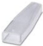
Insulating sleeve, as touch protection, slide onto the conductor before for 6.3 slip-on sleeves