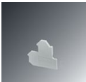
End cover, pitch: 5.08 mm, width: 2.2 mm, number of positions: 1, color: gray

Please be informed that the data shown in this PDF Document is generated from our Online Catalog. Please find the complete data in the user's documentation. Our General Terms of Use for Downloads are valid ( http://phoenixcontact.com/download )