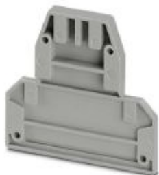
Spacer plate, to compensate for level offsets, length: 56 mm, width: 2.5 mm, height: 52 mm, color: gray

Please be informed that the data shown in this PDF Document is generated from our Online Catalog. Please find the complete data in the user's documentation. Our General Terms of Use for Downloads are valid ( http://phoenixcontact.com/download )