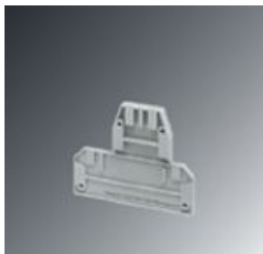
Spacer plate, to compensate for level offsets, length: 67 mm, width: 2.5 mm, color: gray

Please be informed that the data shown in this PDF Document is generated from our Online Catalog. Please find the complete data in the user's documentation. Our General Terms of Use for Downloads are valid ( http://phoenixcontact.com/download )