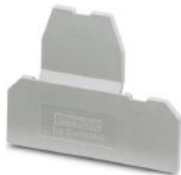
End cover, length: 67.2 mm, width: 2.5 mm, height: 52 mm, color: gray

Please be informed that the data shown in this PDF Document is generated from our Online Catalog. Please find the complete data in the user's documentation. Our General Terms of Use for Downloads are valid ( http://phoenixcontact.com/download )