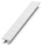
Zack marker strip, can be ordered: Strip, white, labeled according to customer specifications, mounting type: snap into tall marker groove, for terminal block width: 10.2 mm, lettering field size: 10.15 x 10.5 mm, Number of individual labels: 10

Zack marker strip - ZB10,LGS:FORTL.ZAHLEN - 1053014