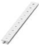
Zack marker strip, Strip, white, labeled, can be labeled with: CMS-P1-PLOTTER, printed horizontally: consecutive numbers 1 ... 10, 11 ... 20, etc. up to 91 ... 100, mounting type: snap into tall marker groove, for terminal block width: 10.2 mm, lettering field size: 10.15 x 10.5 mm, Number of individual labels: 10

Zack marker strip - ZB10,LGS:FORTL.ZAHLEN - 1053014