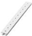
Zack marker strip, Strip, white, labeled, can be labeled with: CMS-P1-PLOTTER, Printed vertically: consecutive numbers 1 ... 10, 11 ... 20, etc. up to 91 ... 100, mounting type: snap into tall marker groove, for terminal block width: 10.2 mm, lettering field size: 10.15 x 10.5 mm, Number of individual labels: 10

Zack marker strip - ZB10,QR:FORTL.ZAHLEN - 1053027