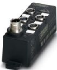
AS-i digital input module, single slave, 4 digital inputs, 24 V DC, 2, 3 and 4-conductor connection method, IP67 protection

Please be informed that the data shown in this PDF Document is generated from our Online Catalog. Please find the complete data in the user's documentation. Our General Terms of Use for Downloads are valid ( http://phoenixcontact.com/download )