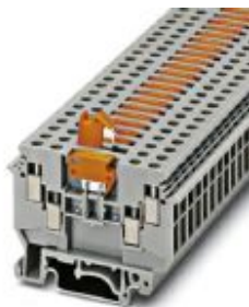
Knife disconnect terminal block with two-sided double connection, cross section: 0.2 - 2.5 mm 2 , AWG: 30 - 10, width: 6.2 mm, color: gray

Please be informed that the data shown in this PDF Document is generated from our Online Catalog. Please find the complete data in the user's documentation. Our General Terms of Use for Downloads are valid ( http://phoenixcontact.com/download )