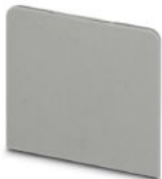
Separating plate, width: 0.5 mm, color: gray

Please be informed that the data shown in this PDF Document is generated from our Online Catalog. Please find the complete data in the user's documentation. Our General Terms of Use for Downloads are valid ( http://phoenixcontact.com/download )