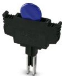
Protective plug with varistor for TERMITRAB base element TT-UKK5-T-BE, nominal voltage: 24 V DC

Please be informed that the data shown in this PDF Document is generated from our Online Catalog. Please find the complete data in the user's documentation. Our General Terms of Use for Downloads are valid ( http://phoenixcontact.com/download )