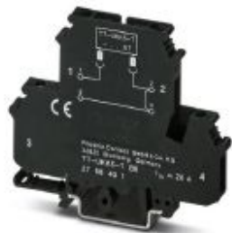
TERMITRAB base element with universal foot, with screw connections on both sides.

Please be informed that the data shown in this PDF Document is generated from our Online Catalog. Please find the complete data in the user's documentation. Our General Terms of Use for Downloads are valid ( http://phoenixcontact.com/download )