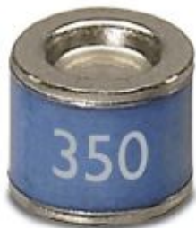
2-electrode gas-filled surge arrester the type H, nominal voltage: 48 V AC

Please be informed that the data shown in this PDF Document is generated from our Online Catalog. Please find the complete data in the user's documentation. Our General Terms of Use for Downloads are valid ( http://phoenixcontact.com/download )