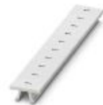
Zack marker strip, Strip, white, labeled, can be labeled with: CMS-P1-PLOTTER, printed horizontally: Identical numbers 1 or 2, etc. up to 100, mounting type: snap into tall marker groove, for terminal block width: 6.2 mm, lettering field size: 6.15 x 10.5 mm, Number of individual labels: 10

Zack marker strip - ZB 6,LGS:GLEICHE ZAHLEN - 1051032