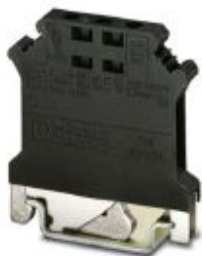
Reference potential terminal block, with black insulation housing, for mounting on NS 32 or NS 35/7.5

Please be informed that the data shown in this PDF Document is generated from our Online Catalog. Please find the complete data in the user's documentation. Our General Terms of Use for Downloads are valid ( http://phoenixcontact.com/download )