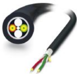
Fiberglass cable, duplex 50/125 µm, by the meter, without connector, for outdoor installation

Please be informed that the data shown in this PDF Document is generated from our Online Catalog. Please find the complete data in the user's documentation. Our General Terms of Use for Downloads are valid ( http://phoenixcontact.com/download )