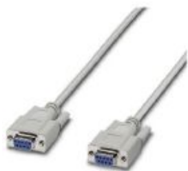
RS-232 cable, 9-pos. D-SUB socket on 9-pos. D-SUB socket, 9-wire, 1:1

Please be informed that the data shown in this PDF Document is generated from our Online Catalog. Please find the complete data in the user's documentation. Our General Terms of Use for Downloads are valid ( http://phoenixcontact.com/download )